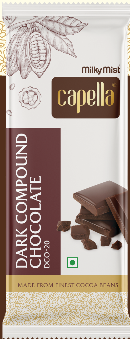
DARK COMPOUND CHOCOLATE (500g)