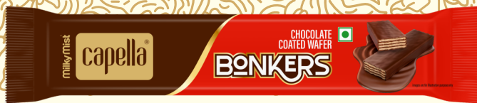
BONKERS WAFER (13g)