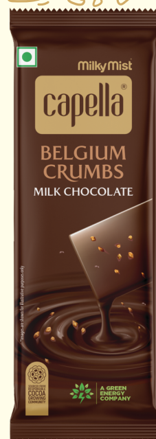
BELGIUM CRUMBS (40g)