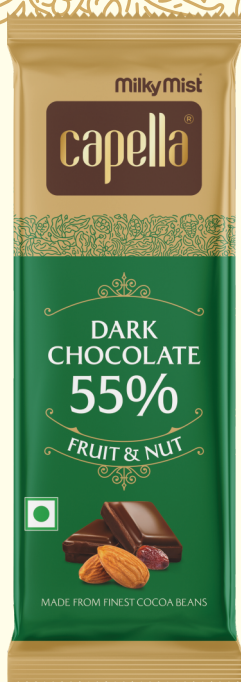
FRUIT & NUT (40g | 80g)