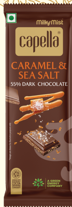
CARAMEL & SEA SALT (40g | 80g)