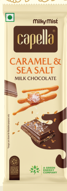
CARAMEL & SEA SALT (40g | 80g)