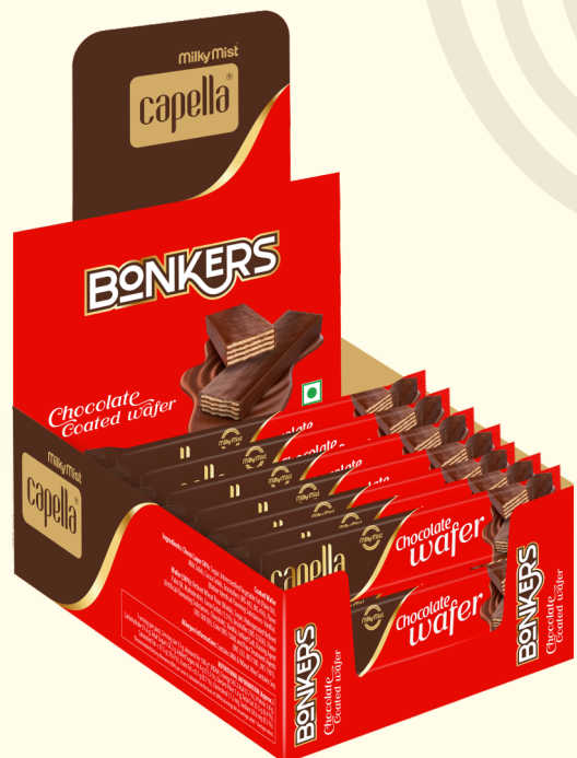
WAFER DISPENSING CARTON (40 PCS)