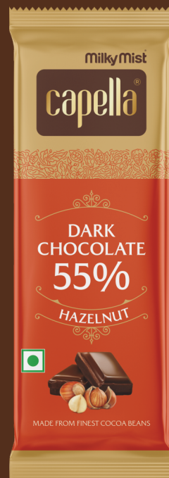
HAZELNUT (40g | 80g)