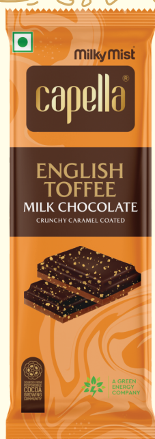
ENGLISH TOFFEE (40g)