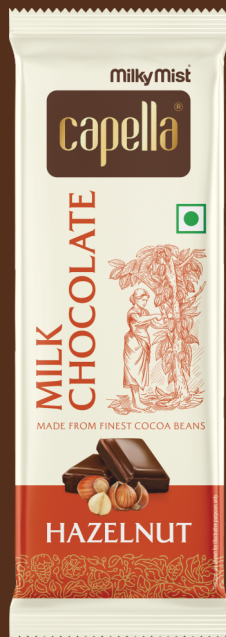
HAZELNUT (40 | 80g)