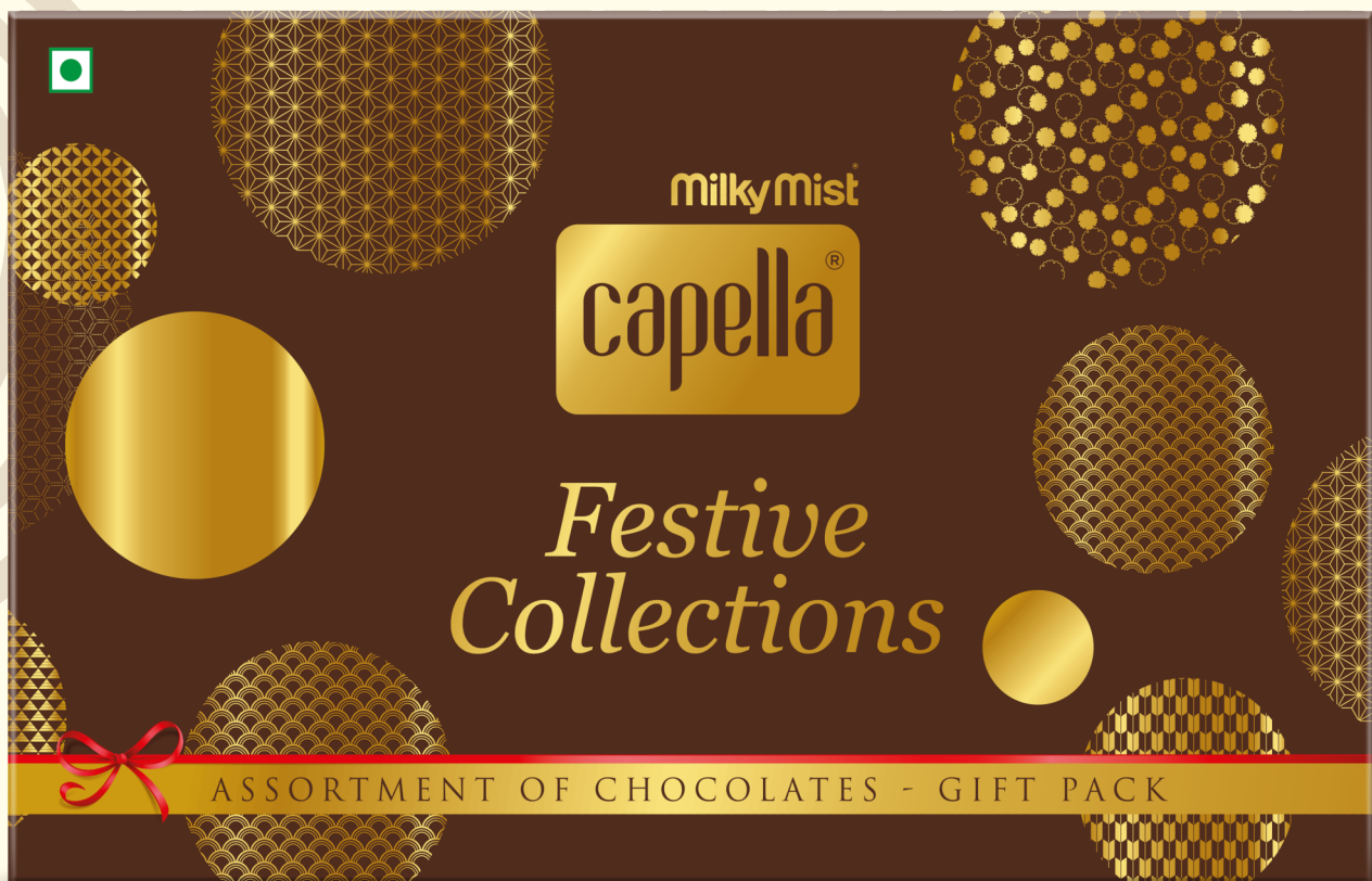
CHOCOLATES GIFT BOX