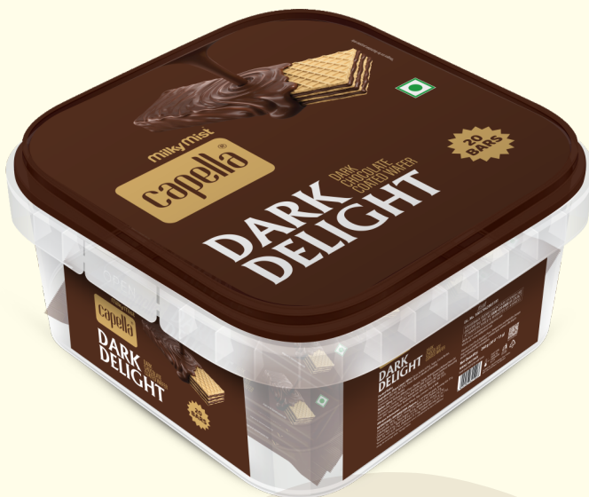
DARK DELIGHT WAFER CONTAINER (20 PCS)