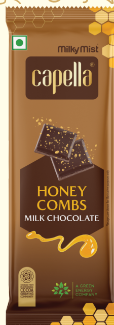
HONEY COMBS (40g)