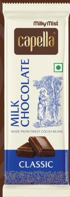
CLASSIC (40g | 80g)