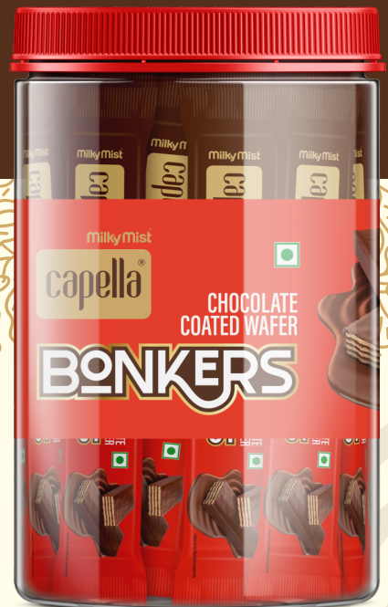
BONKERS WAFER JAR (75 PCS)