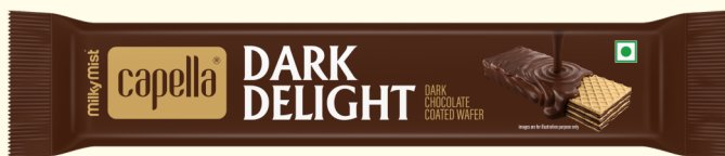
DARK DELIGHT WAFER (13g)