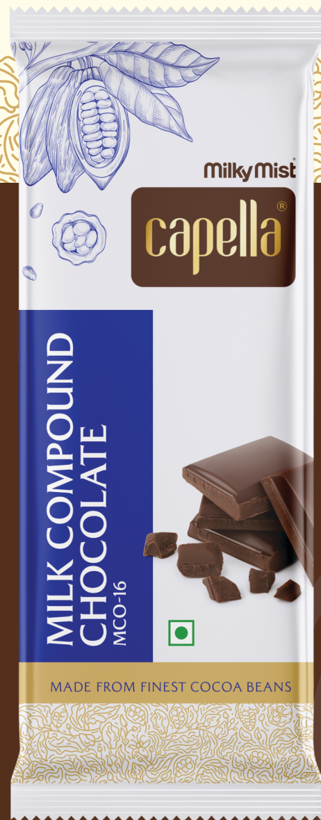
MILK COMPOUND CHOCOLATE (500g)